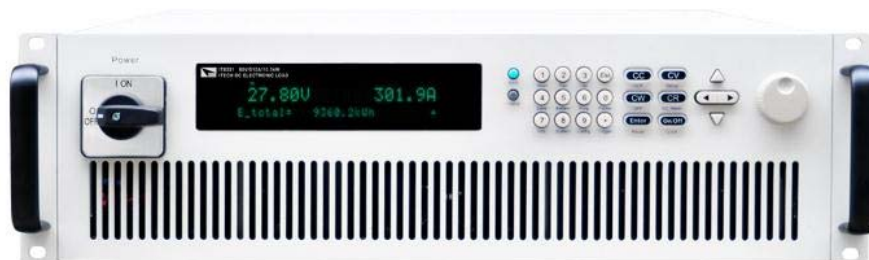
Figure 2: The IT8331 / IT8332 can sink 10.5KW. Up to 10 units can be operated in parallel to sink 105KW

of the load energy. The reliability of the IT8300 is high, because the load dissipates very little heat per KW of the measured power. The IT8300 does not need a lot of MOSFETs or IGBTs in parallel to handle heat dissipation, resulting in longer life and lower maintenance expense.