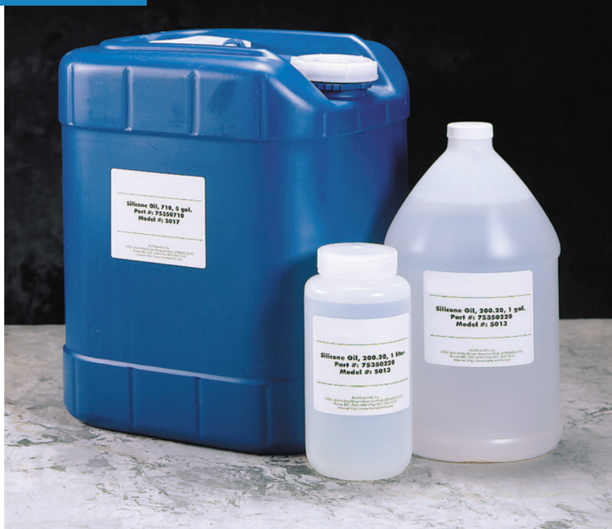
Fluke Calibration offers a wide variety of bath fluids in different container sizes.

Viscosity is a measure of a fluid's resistance to flow—we often think of it simply as "thickness." Kinematic viscosity is the ratio of absolute viscosity to density and is measured in "stokes" (at a specific temperature), which are commonly divided by 100 to give us more helpful "centistokes." The higher the number of centistokes, the more viscous (or thick) a fluid is. Viscosity is always stated at a specific temperature (often at 25 °C) and increases as the fluid's temperature decreases (and vice versa).