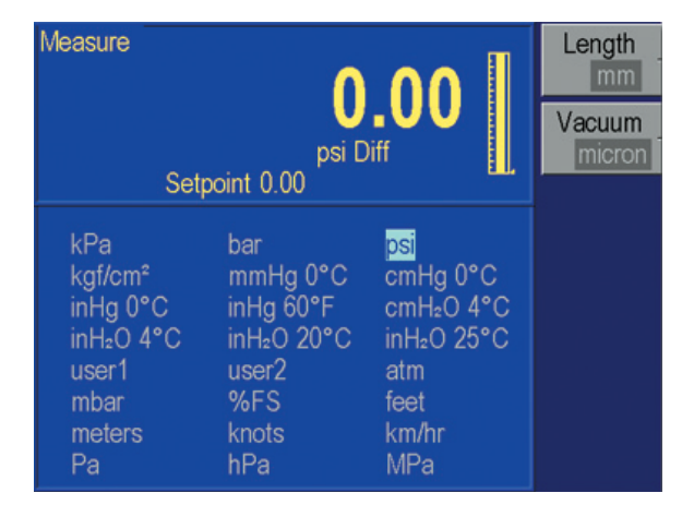
The large color display allows the pressure value to be displayed even when viewing a submenu selection such as the units selection screen shown above.

The Series 7250 Pressure Controller/Calibrator can easily automate your test and calibration workload. All are easy to use, easy to maintain, and have the reliability, performance and features that you want. The Series 7250 features an easy-to-navigate menu structure with full text descriptions for menus and commands.