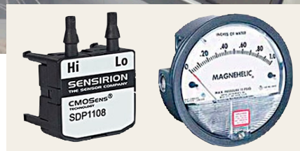
Figure 1. Examples of typical instruments that are used to monitor DP in a clean room environment (Fluke Calibration does not indorse these products).