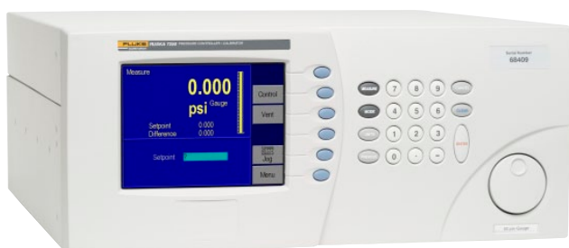
Figure 5. 7250LP.

The 7250LP is specially designed to perform draft range pressure calibrations. It is available in full scale values of 7.5 kPa (30 inH 2 O), 15 kPa (60 inH 2 O), or 25 kPa (100 inH 2 O). The pressure sensor is then dual-scaled to provide better accuracy and control performance at the low end of each scale. The 7250LP includes a small, internal volume which reduces the need for the DVU. For some applications, where ambient conditions will potentially fluctuate dramatically, the DVU will be beneficial.