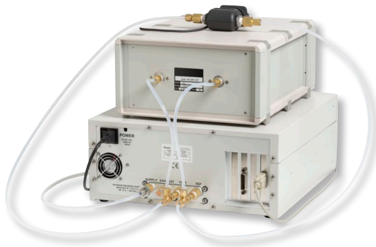
Figure 4. 7250LP, DVU, and DUT connected.

It is also important to remove restrictions between the volumes that exist within the system. Volumes can be manifolds, filter housings even the device under test (DUT). Restrictions include small inside diameter tubing, needle valves and filters.